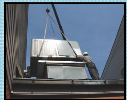
The heavy work is almost done. Now for all the connections.