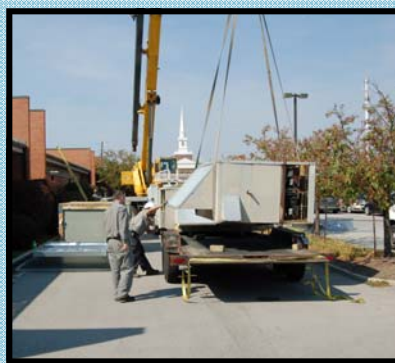
The old unit coming down and ready to be hauled away.