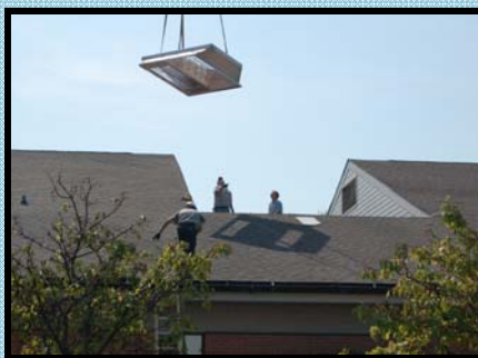
The base of the new unit being put into place.