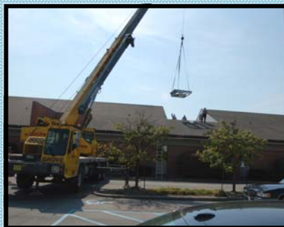
It is a long way over and a long way down!