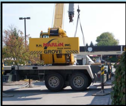
Huge equipment positioned to remove the old unit and hoist the new one into place.

The new equipment has now been installed, and the church has already begun to realize a significant energy savings.